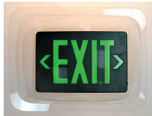
VERS – 19" x 12" x 7 1/2"d (inside dimensions)

At American Time & Signal, we continually strive to improve our products to meet our customers' needs and to provide the best possible value. The above specifications are believed to be correct, are subject to change without notice and may otherwise vary from the above. Please call if you need verification of any specifications or the suitability of a particular product for a particular application. © American Time & Signal Company